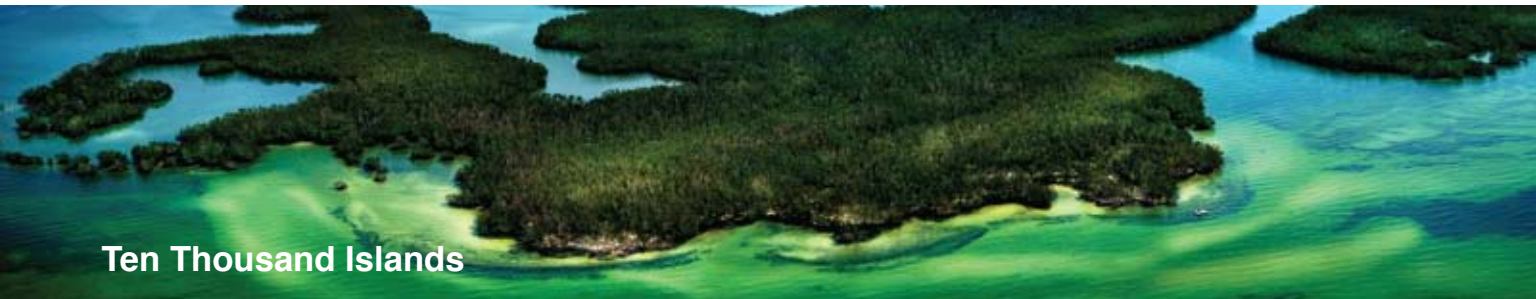
Ten Thousand Islands

"It's not just the eco-system. It's the heritage and the culture."