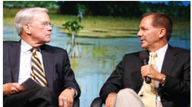
Tom Brokaw and Paul Tudor Jones II

Senior officials from Tallahassee and Washington agreed on the need for additional land acquisition in the Everglades Agricultural Area for water storage and pollution removal in filtration marshes to be built on former sugar cane and citrus farms. There also was widespread agreement that the federal government considered the restoration of the Everglades as a necessity to protect the future ecological and economic health of one of the nation's fastest-growing states.